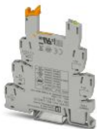
6.2 mm PLC basic terminal block with screw connection, without relays or solid-state relay, for mounting on DIN rail NS 35/7,5, 1 PDT, input voltage 24 V DC

Please be informed that the data shown in this PDF Document is generated from our Online Catalog. Please find the complete data in the user's documentation. Our General Terms of Use for Downloads are valid ( http://phoenixcontact.com/download )