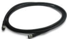
The figure shows a version of the product

Antenna cable, outside diameter: 10 mm (0.4 in.), inner conductor: stranded, attenuation: 1.0 / 1.8 / 3.1 dB at 0.9 / 2.4 / 5.8 GHz, connection: 2 x N (male), cable length: 3 m (10 ft.)