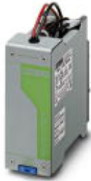
Energy storage device, lead AGM, VRLA technology, 12 V DC, 2.6 Ah.

Please be informed that the data shown in this PDF Document is generated from our Online Catalog. Please find the complete data in the user's documentation. Our General Terms of Use for Downloads are valid ( http://phoenixcontact.com/download )