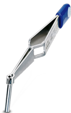
Positioning and unlocking tool for RC crimp contacts (D-SUB) for pin/socket, diameter: 2 mm

Please be informed that the data shown in this PDF Document is generated from our Online Catalog. Please find the complete data in the user's documentation. Our General Terms of Use for Downloads are valid ( http://phoenixcontact.com/download )