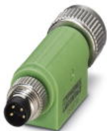
Adapter, 4-position, Plug straight M8, A-coded, on Socket straight M12, A-coded

Please be informed that the data shown in this PDF Document is generated from our Online Catalog. Please find the complete data in the user's documentation. Our General Terms of Use for Downloads are valid ( http://phoenixcontact.com/download )