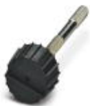
Fillister head screw with plastic knurl, M3 x 40

Screw - SAC-V-SCREW-M3-29 KNURL - 1403779