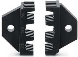
Replacement die for CRIMPFOX 16R TWIN

Please be informed that the data shown in this PDF Document is generated from our Online Catalog. Please find the complete data in the user's documentation. Our General Terms of Use for Downloads are valid ( http://phoenixcontact.com/download )