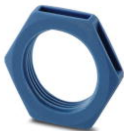
Circular connectors (device-side), Range of articles: PRC, Nut, color: blue

Please be informed that the data shown in this PDF Document is generated from our Online Catalog. Please find the complete data in the user's documentation. Our General Terms of Use for Downloads are valid ( http://phoenixcontact.com/download )