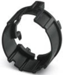
Circular connectors (cable-side), Range of articles: PRC, Coding element, color: black

Please be informed that the data shown in this PDF Document is generated from our Online Catalog. Please find the complete data in the user's documentation. Our General Terms of Use for Downloads are valid ( http://phoenixcontact.com/download )