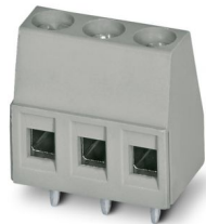
The figure shows a 3-pos. version of the product

Printed circuit board terminal, nominal current: 17.5 A, rated voltage (III/2): 400 V, nominal cross section: 1.5 mm 2 , number of potentials: 14, number of rows: 1, number of positions per row: 14, product range: BC-X14, pitch: 5 mm, connection method: Screw connection with tension sleeve, screw head form: H1L Slotted Phillips recess, mounting: Wave soldering, conductor/PCB connection direction: 0 °, color: black, Pin layout: Linear pinning, Solder pin [P]: 3.5 mm, number of solder pins per potential: 1, type of packaging: packed in cardboard