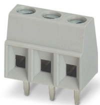
The figure shows the gray 3-pos. version

Printed circuit board terminal, nominal current: 13.5 A, rated voltage (III/2): 200 V, nominal cross section: 1.5 mm 2 , number of potentials: 16, number of rows: 1, number of positions per row: 16, product range: BC-X9, pitch: 3.5 mm, connection method: Screw connection with tension sleeve, screw head form: L Slotted, mounting: Wave soldering, conductor/PCB connection direction: 0 °, color: black, Pin layout: Linear pinning, Solder pin [P]: 3.5 mm, number of solder pins per potential: 1, type of packaging: packed in cardboard