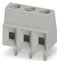
The figure shows the gray 3-pos. version

Printed circuit board terminal, nominal current: 13.5 A, rated voltage (III/2): 200 V, nominal cross section: 1.5 mm 2 , number of potentials: 3, number of rows: 1, number of positions per row: 3, product range: BC-X9, pitch: 3.5 mm, connection method: Screw connection with tension sleeve, screw head form: L Slotted, mounting: Wave soldering, conductor/PCB connection direction: 0 °, color: black, Pin layout: Linear pinning, Solder pin [P]: 3.5 mm, number of solder pins per potential: 1, type of packaging: packed in cardboard