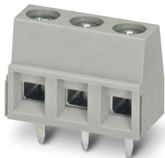
The figure shows the gray version

Printed circuit board terminal, nominal current: 13.5 A, rated voltage (III/2): 400 V, nominal cross section: 1.5 mm 2 , number of potentials: 2, number of rows: 1, number of positions per row: 2, product range: BC-X10, pitch: 5.08 mm, connection method: Screw connection with tension sleeve, screw head form: H1L Slotted Phillips recess, mounting: Wave soldering, conductor/PCB connection direction: 0 °, color: black, Pin layout: Linear pinning, Solder pin [P]: 3.5 mm, number of solder pins per potential: 1, type of packaging: packed in cardboard