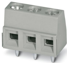
The figure shows a 3-pos. version of the product

Printed circuit board terminal, nominal current: 13.5 A, rated voltage (III/2): 400 V, nominal cross section: 1.5 mm 2 , number of potentials: 8, number of rows: 1, number of positions per row: 8, product range: BC-X10, pitch: 5 mm, connection method: Screw connection with tension sleeve, screw head form: H1L Slotted Phillips recess, mounting: Wave soldering, conductor/PCB connection direction: 0 °, color: signal gray, Pin layout: Linear pinning, Solder pin [P]: 3.5 mm, number of solder pins per potential: 1, type of packaging: packed in cardboard