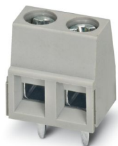
The figure shows the gray version

Printed circuit board terminal, nominal current: 13.5 A, rated voltage (III/2): 400 V, nominal cross section: 1.5 mm 2 , number of potentials: 3, number of rows: 1, number of positions per row: 3, product range: BC-X10, pitch: 5 mm, connection method: Screw connection with tension sleeve, screw head form: H1L Slotted Phillips recess, mounting: Wave soldering, conductor/PCB connection direction: 0 °, color: pastel green, Pin layout: Linear pinning, Solder pin [P]: 3.5 mm, number of solder pins per potential: 1, type of packaging: packed in cardboard