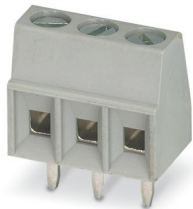
The figure shows the 3-pos. version

Printed circuit board terminal, nominal current: 13.5 A, rated voltage (III/2): 200 V, nominal cross section: 1.5 mm 2 , number of potentials: 11, number of rows: 1, number of positions per row: 11, product range: BC-X9, pitch: 3.5 mm, connection method: Screw connection with tension sleeve, screw head form: L Slotted, mounting: Wave soldering, conductor/PCB connection direction: 0 °, color: signal gray, Pin layout: Linear pinning, Solder pin [P]: 3.5 mm, number of solder pins per potential: 1, type of packaging: packed in cardboard