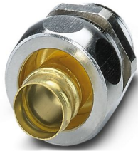
Cable gland made from brass with Pg thread, IP65 protection

Please be informed that the data shown in this PDF document is generated from our online catalog. Please find the complete data in the user documentation. Our general terms of use for downloads are valid.