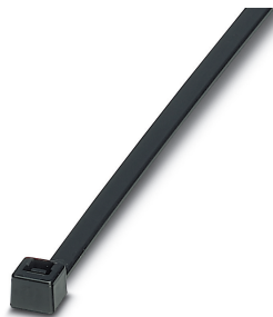
Cable binders for quick and secure bundling, standard version

Please be informed that the data shown in this PDF Document is generated from our Online Catalog. Please find the complete data in the user's documentation. Our General Terms of Use for Downloads are valid ( http://phoenixcontact.com/download )