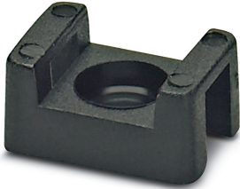
Cable binder base, for cable binders up to 5 mm wide, screwable, 3.5 mm fixing hole, 2-sided cable binder feed-through

Please be informed that the data shown in this PDF Document is generated from our Online Catalog. Please find the complete data in the user's documentation. Our General Terms of Use for Downloads are valid ( http://phoenixcontact.com/download )