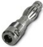
Test plugs, color: silver