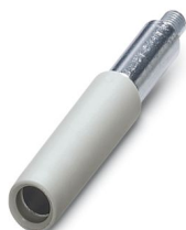
Test plug strip, number of positions: 1, color: gray

Please be informed that the data shown in this PDF document is generated from our online catalog. Please find the complete data in the user documentation. Our general terms of use for downloads are valid.