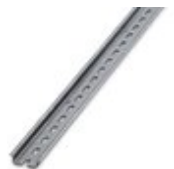
DIN rail perforated, acc. to EN 60715, material: Steel, Galvanized, white passivated, Standard profile, color: silver

DIN rail perforated - NS 35/ 7,5 WH PERF 2000MM - 1204119