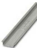
DIN rail, unperforated, acc. to EN 60715, material: Steel, galvanized, passivated with a thick layer, Standard profile, color: silver

DIN rail, unperforated - NS 35/ 7,5 UNPERF 2000MM - 0801681