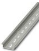
DIN rail perforated, acc. to EN 60715, material: Steel, galvanized, passivated with a thick layer, Standard profile, color: silver

DIN rail perforated - NS 35/ 7,5 PERF 2000MM - 0801733