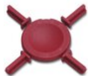
Coding star, length: 3 mm, width: 3 mm, height: 6 mm, color: red