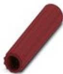
Insulating sleeve, color: red