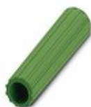
Insulating sleeve, color: green