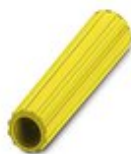
Insulating sleeve, color: yellow