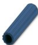
Insulating sleeve, color: blue