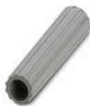
Insulating sleeve, color: gray