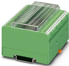
Lamp test module, 2 diodes with common cathode: with 16 pairs, with common triggering

Please be informed that the data shown in this PDF document is generated from our online catalog. Please find the complete data in the user documentation. Our general terms of use for downloads are valid.