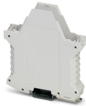
The figure shows a version of the item without vents

Please be informed that the data shown in this PDF document is generated from our online catalog. Please find the complete data in the user documentation. Our general terms of use for downloads are valid.