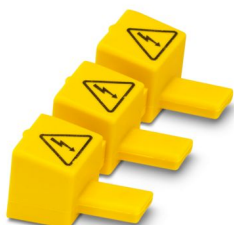
Protective covers for TMC 8 bus bars. Cuttable, three positions, yellow.

Please be informed that the data shown in this PDF document is generated from our online catalog. Please find the complete data in the user documentation. Our general terms of use for downloads are valid.