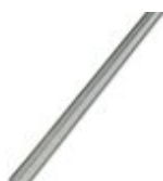
Continuous plug-in bridge, length: 500 mm, color: gray

Continuous plug-in bridge - FBST 500-PLC GY - 2966838