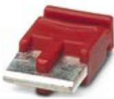
Single plug-in bridge, color: red

Single plug-in bridge - FBST 6-PLC RD - 2966236