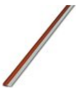
Continuous plug-in bridge, color: red

Continuous plug-in bridge - FBST 500-PLC RD - 2966786