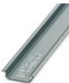
DIN rail, unperforated, acc. to EN 60715, material: Steel, Galvanized, white passivated, Standard profile, color: silver

DIN rail, unperforated - NS 35/ 7,5 WH UNPERF 2000MM - 1204122