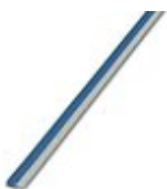
Continuous plug-in bridge, color: blue

Continuous plug-in bridge - FBST 500-PLC BU - 2966692