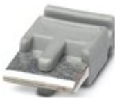
Single plug-in bridge, color: gray

Single plug-in bridge - FBST 6-PLC GY - 2966825