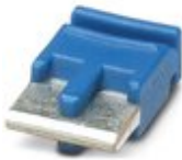
Single plug-in bridge, color: blue

Single plug-in bridge - FBST 6-PLC BU - 2966812