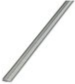
Continuous plug-in bridge, color: gray

Continuous plug-in bridge - FBST 500-PLC GY - 2966838