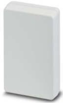
Handheld housing, C-Mini, light gray, front level closed, consisting of two half shells with screws

Please be informed that the data shown in this PDF document is generated from our online catalog. Please find the complete data in the user documentation. Our general terms of use for downloads are valid.