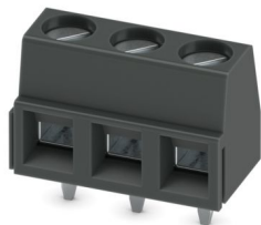
The figure shows a 2-position version

Printed circuit board terminal, nominal current: 13.5 A, rated voltage (III/2): 320 V, nominal cross section: 1.5 mm 2 , number of potentials: 3, number of rows: 1, number of positions per row: 3, product range: MKDSN 1,5/..-HT, pitch: 5.08 mm, connection method: Screw connection with tension sleeve, screw head form: L Slotted, mounting: THR soldering / wave soldering, conductor/PCB connection direction: 0 °, color: black, Pin layout: Linear pinning, Solder pin [P]: 3.5 mm, number of solder pins per potential: 1, type of packaging: packed in cardboard. This article can be soldered in the reflow furnace together with SMD components.