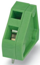
The figure shows a 1-pos. version of the product

Printed circuit board terminal, nominal current: 16 A, rated voltage (III/2): 320 V, nominal cross section: 1.5 mm 2 , number of potentials: 6, number of rows: 1, number of positions per row: 6, product range: ZFKDS(A) 1,5, pitch: 7.62 mm, connection method: Spring-cage connection, mounting: Wave soldering, conductor/PCB connection direction: 45 °, color: green, Pin layout: Linear pinning, Solder pin [P]: 3.5 mm, number of solder pins per potential: 2, type of packaging: packed in cardboard