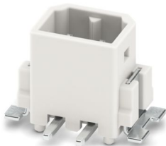
The figure shows a 3-position version

PCB headers, nominal cross section: 0.5 mm 2 , color: signal white, nominal current: 6 A, rated voltage (III/2): 160 V, contact surface: Sn, contact connection type: Pin, number of potentials: 2, number of rows: 1, number of positions: 2, number of connections: 2, product range: PTSM 0,5/..-HV-SMD WH, pitch: 2.5 mm, mounting: SMD soldering, pin layout: Linear pad geometry, number of solder pins per potential: 1, plug-in system: COMBICON PTSM, Pin connector pattern alignment: Standard, locking: without, mounting method: without, type of packaging: 24 mm wide tape