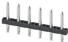
The figure shows a 6-position version

Pin strip, nominal cross section: 1.5 mm 2 , color: black, nominal current: 12 A (depends on the plug used), rated voltage (III/2): 320 V, contact surface: Sn, contact connection type: Pin, number of potentials: 3, number of rows: 1, number of positions: 3, number of connections: 3, product range: PST 1,3/..-V, pitch: 5 mm, mounting: THR soldering / wave soldering, pin layout: Linear pinning, solder pin [P]: 3.5 mm, plug-in system: COMBICON PST 1,3, locking: without, mounting method: without, type of packaging: packed in cardboard, The maximum current depends on the plug used. The lower of the two current values apply for plug and pin strip. The pin strip is made of highly temperature resistant plastic and is thus suitable for the reflow process.