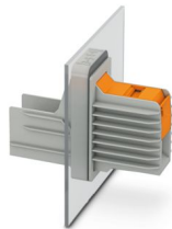
The figure shows a 1-pos. version of the product

Panel feed-through terminal block, connection method: T-LOX knee lever connection, Cable lug connection, number of positions: 4, load current: 232 A, connection direction of the conductor to plug-in direction: 0 °, width: 123 mm, color: gray