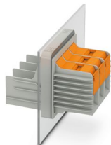
Figure shows the standard item

Panel feed-through terminal block, connection method: T-LOX knee lever connection, Cable lug connection, number of positions: 3, load current: 232 A, connection direction of the conductor to plug-in direction: 0 °, width: 97 mm, color: gray