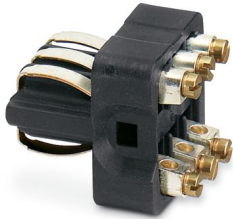
HEAVYCON spring insert, STAF series, 6-pos., screw connection without wire protection

Please be informed that the data shown in this PDF document is generated from our online catalog. Please find the complete data in the user documentation. Our general terms of use for downloads are valid.