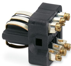
HEAVYCON spring insert, STAF series, 6-pos., screw connection without wire protection

Please be informed that the data shown in this PDF document is generated from our online catalog. Please find the complete data in the user documentation. Our general terms of use for downloads are valid.