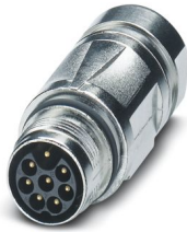
The figure shows the 4-pos. (3+PE) product version

Please be informed that the data shown in this PDF document is generated from our online catalog. Please find the complete data in the user documentation. Our general terms of use for downloads are valid.