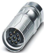
The figure shows the 4-pos. (3+PE) product version

Please be informed that the data shown in this PDF document is generated from our online catalog. Please find the complete data in the user documentation. Our general terms of use for downloads are valid.