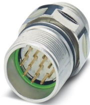
The figure shows the product version with solder contacts

Please be informed that the data shown in this PDF document is generated from our online catalog. Please find the complete data in the user documentation. Our general terms of use for downloads are valid.