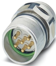
The figure shows the product version with solder contacts

Please be informed that the data shown in this PDF document is generated from our online catalog. Please find the complete data in the user documentation. Our general terms of use for downloads are valid.