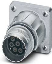
The figure shows the 8-pos. socket version

Please be informed that the data shown in this PDF document is generated from our online catalog. Please find the complete data in the user documentation. Our general terms of use for downloads are valid.