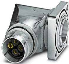
The figure shows the 4-pos. version with sockets

Please be informed that the data shown in this PDF document is generated from our online catalog. Please find the complete data in the user documentation. Our general terms of use for downloads are valid.