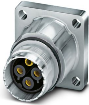
The figure shows the 4-pos. version

Please be informed that the data shown in this PDF document is generated from our online catalog. Please find the complete data in the user documentation. Our general terms of use for downloads are valid.