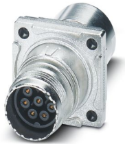
The figure shows the 8-position version.

Please be informed that the data shown in this PDF document is generated from our online catalog. Please find the complete data in the user documentation. Our general terms of use for downloads are valid.