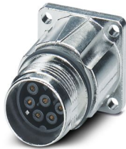
The figure shows the 8-pos. (7+PE) product version

Please be informed that the data shown in this PDF document is generated from our online catalog. Please find the complete data in the user documentation. Our general terms of use for downloads are valid.