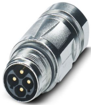
The figure shows the 4-pos. (3+PE) product version

Please be informed that the data shown in this PDF document is generated from our online catalog. Please find the complete data in the user documentation. Our general terms of use for downloads are valid.