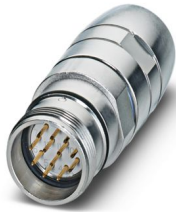
The figure shows the 12-pos. product version

Please be informed that the data shown in this PDF document is generated from our online catalog. Please find the complete data in the user documentation. Our general terms of use for downloads are valid.