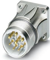
The figure shows the 8-pos. (4+3+PE) product version

Please be informed that the data shown in this PDF document is generated from our online catalog. Please find the complete data in the user documentation. Our general terms of use for downloads are valid.