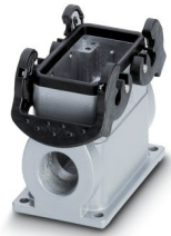
HEAVYCON box mounting base B10, with double locking latch, height 52 mm, with supports 2xM25

Please be informed that the data shown in this PDF document is generated from our online catalog. Please find the complete data in the user documentation. Our general terms of use for downloads are valid.